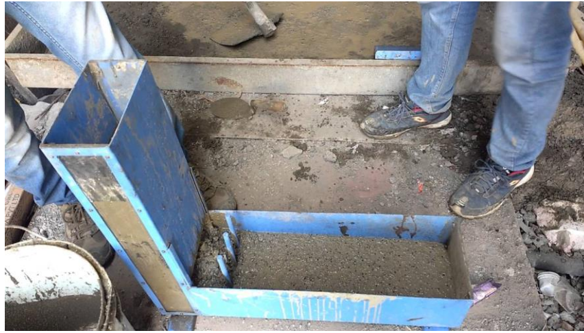
Figure 7: L-Box Test

L Box Test for self-consolidating concrete assess its concreteness and its extent to blocking by reinforcement. The apparatus consists of a rectangular section box in the shape of an L with a horizontal and vertical section which are separated by a movable gate in front of which the vertical lengths of reinforcement bars are fitted.