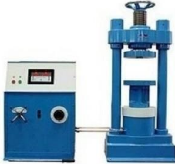
Figure 8: Compressive Strength Test

Compressive strength is about compression test carried on concrete cubes based on the standard guidelines. In this study, the concrete cubes specimen was tested under 2200 KN capacity compression testing machine. Concrete cube crushing strength is assessed by applying compressive load at the rate of 150 KN/min until the specimen fails.