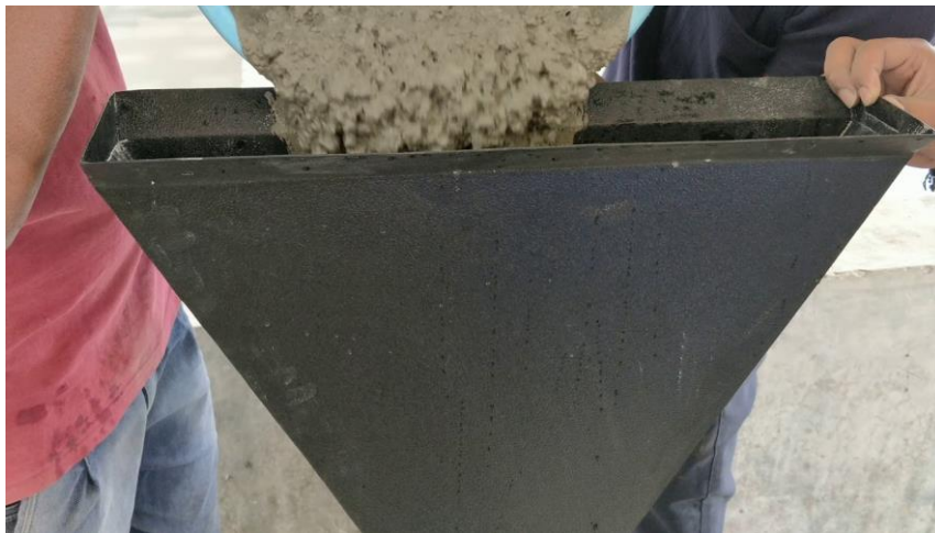
Figure 6: Funnel Test

V Funnel test is used for assessment of the filling ability of the concrete with a maximum aggregate size of 20 mm. Ozawa is credited with development of the test at first place. A V-shaped funnel is used in this test. The test procedure is that the funnel is filled with concrete and the time is measured for its flowing through the apparatus. The funnel can be refilled with concrete and left for 5 minutes to settle. In case of segregation, the flow time will be increasing.