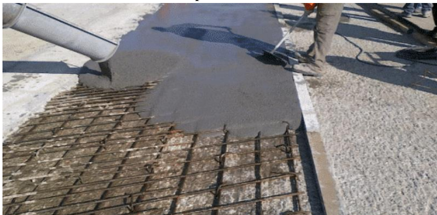
Figure 1: Self-Consolidating Concrete

For obtaining the higher workability on concrete, it is required that good spacing between the aggregates as to minimize the friction between them. Concrete sample based on good space between the aggregates is covered by cement paste, the aggregates can be compacted and squeeze out for excess cement paste surrounding it. The left over is the top layer with just the paste itself and below is a compact state of aggregates having enough cement paste to fill the void spaces. The cement paste in the voids is labelled as ‘compact paste’; whereas the cement paste which wraps around the aggregates is called ‘excess paste’. Easier and homogeneous dispersion is possible because of this excess paste in the matrix.