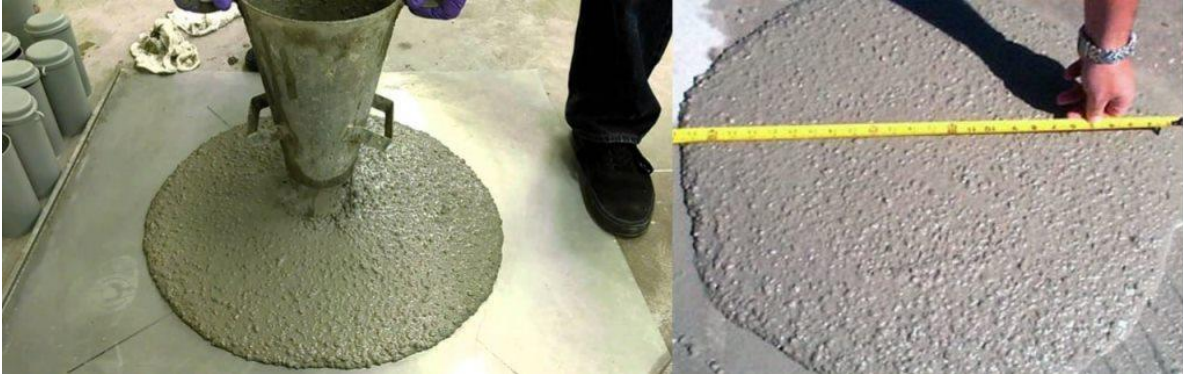
Figure 5: Slump Flow Test

The first test is slump flow test which is normally used for the assessment of the horizontal flow and flow rate of self-consolidating concrete in the absence of obstructions. Originally, the test was about measuring the underwater concrete.